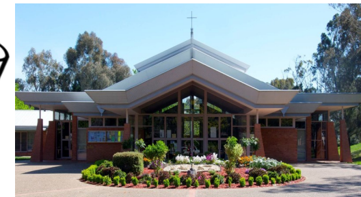
St Michael's Church Tyrrell Cct Kaleen

Parish Office: 2 Tyrrell Circuit Kaleen Ph: 6241 3364. Email: belconnennorth@cg.org.au. Website: www.cg.org.au/belconnennorth