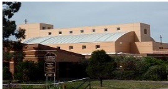
St Monica's Church Deffell St Evatt